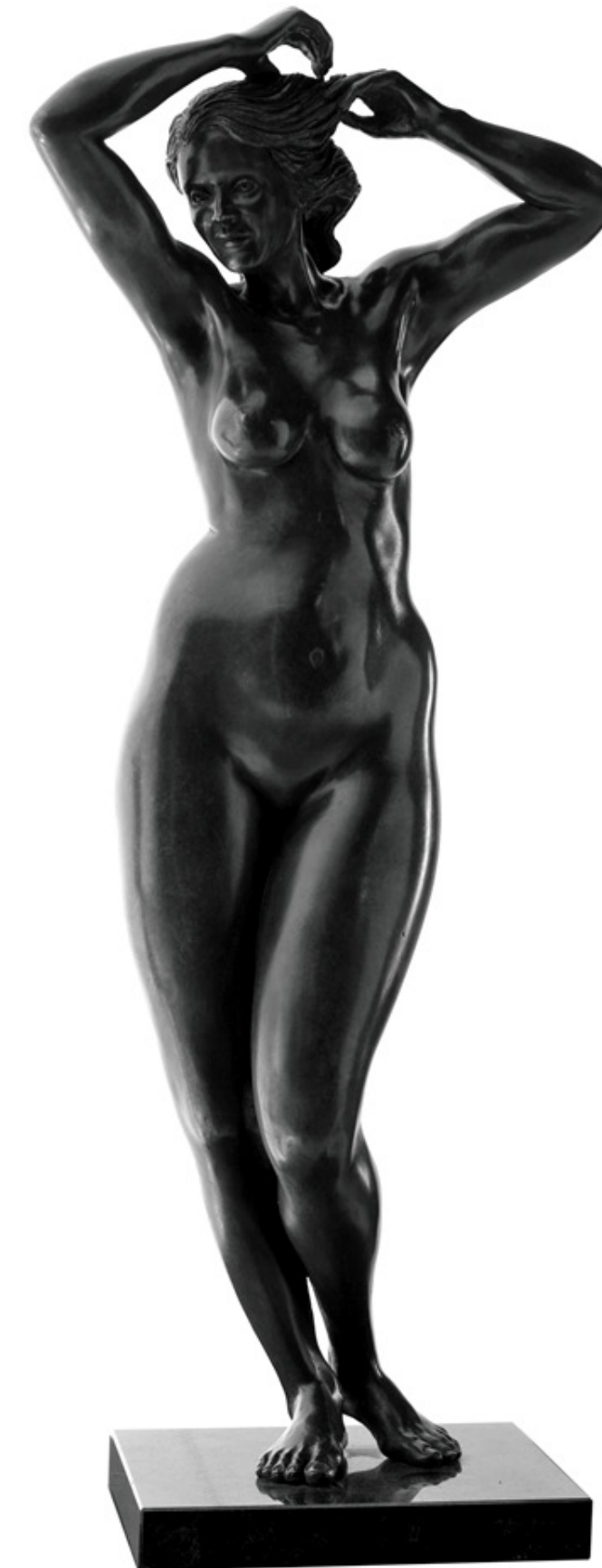
Venus 2007 Bronze 680 x 280 x 180 mm

During this period in history women were commodities traded for land in arranged marriages, hardly the romantic ideal of Botticelli's Birth of Venus painting. Perhaps it is the idea of a perfect love that captures our imagination and made this work so popular. How have attitudes changed and what image do we have of a woman now in this day and age?