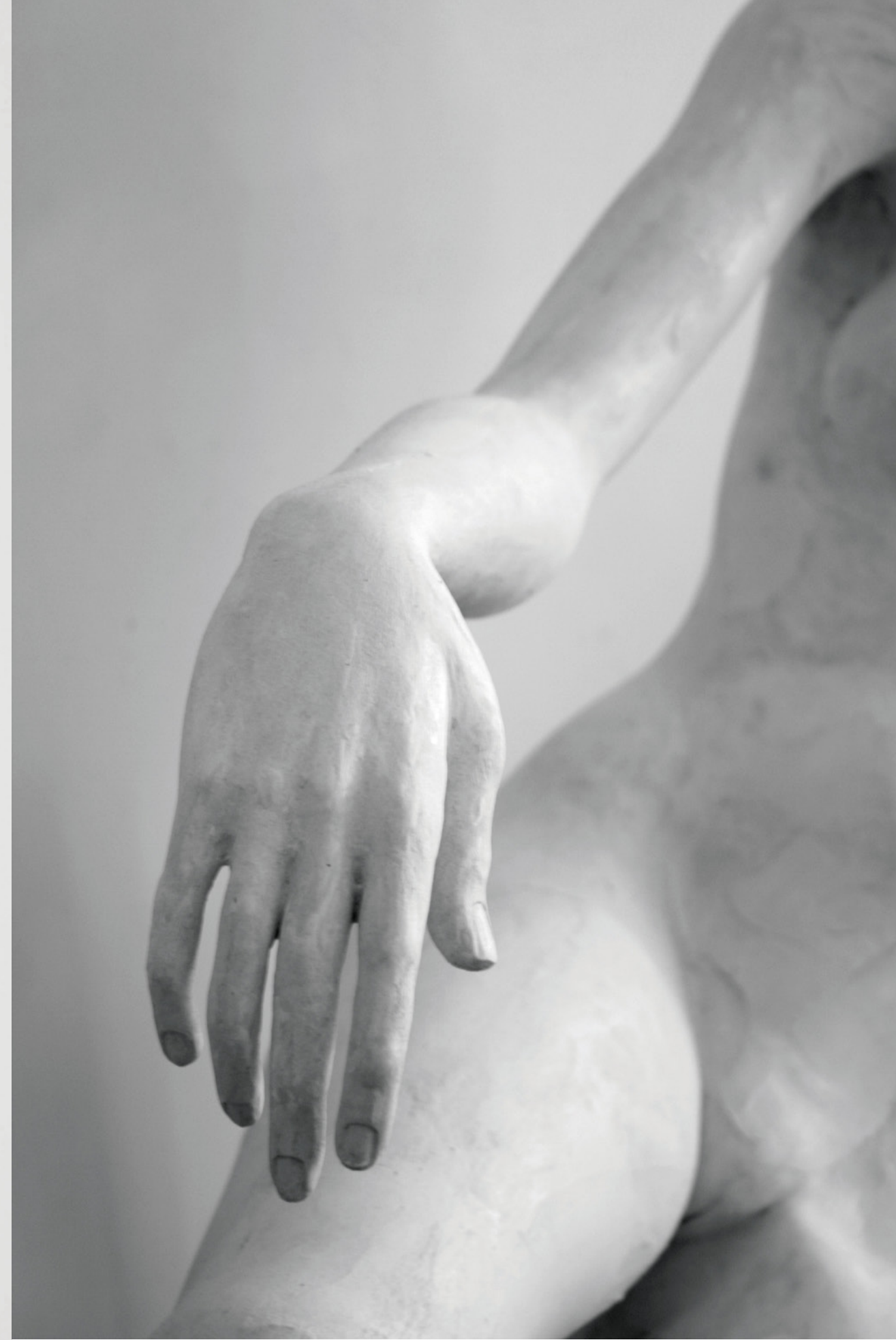
Jade Life size 2008 Resin 1690 x 1600 x 600 mm