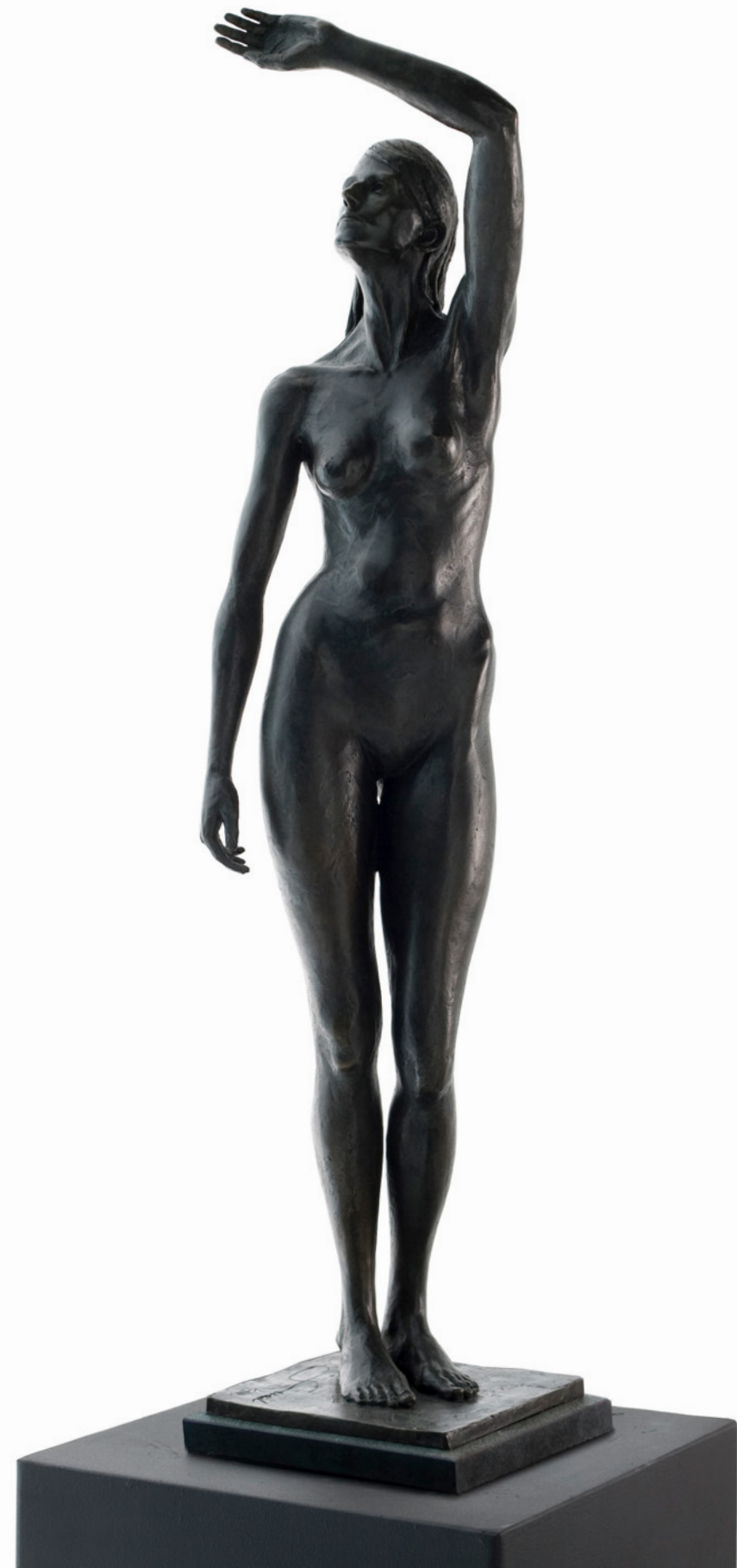
Lindy Torso 2007 Bronze 555 x 190 x 155 mm